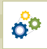
Begin Exposure and Response Prevention (ERP)