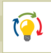
Psychoeducation about OCD and evidence-based treatments