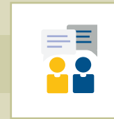
Weekday Individualized Support