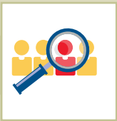
Pre-screening prior to admission