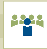
Participation in group therapy